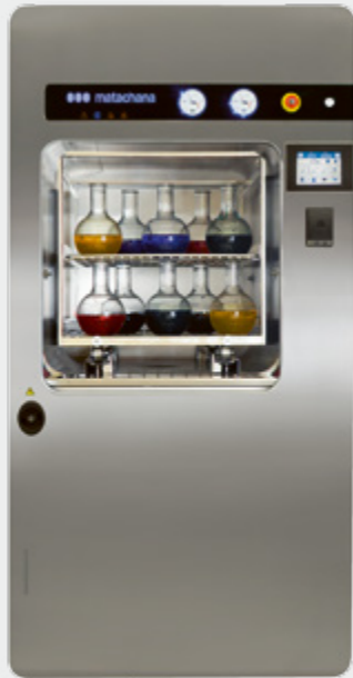
Stainless steel front panel EN 1.4301 (AISI-304) (optional)

The sterilizers are designed and manufactured using the latest technologies available in the market to achieve the best results in terms of energy savings and reducing water consumption. An example is the steam generator (in the devices fitted with it), which has an integrated "smart" economizer system . It is fully controlled by the sterilizer's CPU, so that the right amount of steam for the program is produced, adapting to the needs of pressure and temperature of the program selected and run. It is specifically designed to let in the appropriate water volume in the generator and at the right time of the cycle to minimize the consumption of treated water and power of the generator.