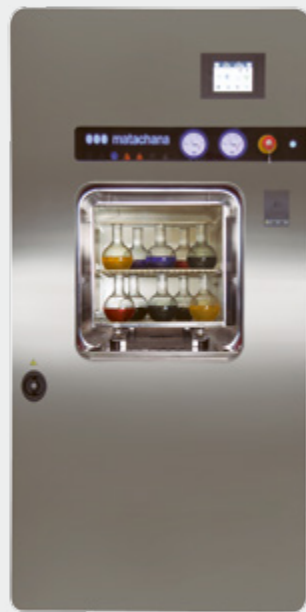
Stainless steel front panel 1.4301 (AISI-304) (optional)

The sterilizers are designed and manufactured using the latest technologies available in the market to achieve the best results in terms of energy savings and reducing water consumption. An example is the steam generator (in the devices fitted with it), which has an integrated "smart" economizer system . It is fully controlled by the sterilizer's CPU, so that the right amount of steam for the program is produced, adapting to the needs of pressure and temperature of the program selected and run. It is specifically designed to let in the appropriate water volume in the generator and at the right time of the cycle to minimize the consumption of treated water and power of the generator.