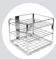
Flexible rack for cleaning in 4 levels. Available in 2, 3 or 4 levels.

A wide range of racks, modules and other equipment are available to suit every need. Here you can see a selection of our equipment: