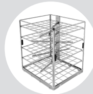
Flexible rack for cleaning in 5 levels. Available in 3, 4 or 5 levels.

A wide range of racks, modules and other equipment are available to suit every need. Here you can see a selection of our equipment: