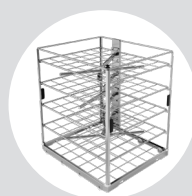
Flexible rack for cleaning in 5 levels. Available in 3, 4 or 5 levels.

A wide range of racks, distributors and other equipment are available to suit every need. Here you can see a selection of our equipment: