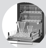
Shelves in three levels with distributors to accommodate all types of glassware.