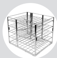
Flexible rack for cleaning in 5 levels. Available in 3, 4 or 5 levels.

A wide range of racks, modules and other equipment are available to suit every need. Here you can see a selection of our equipment: